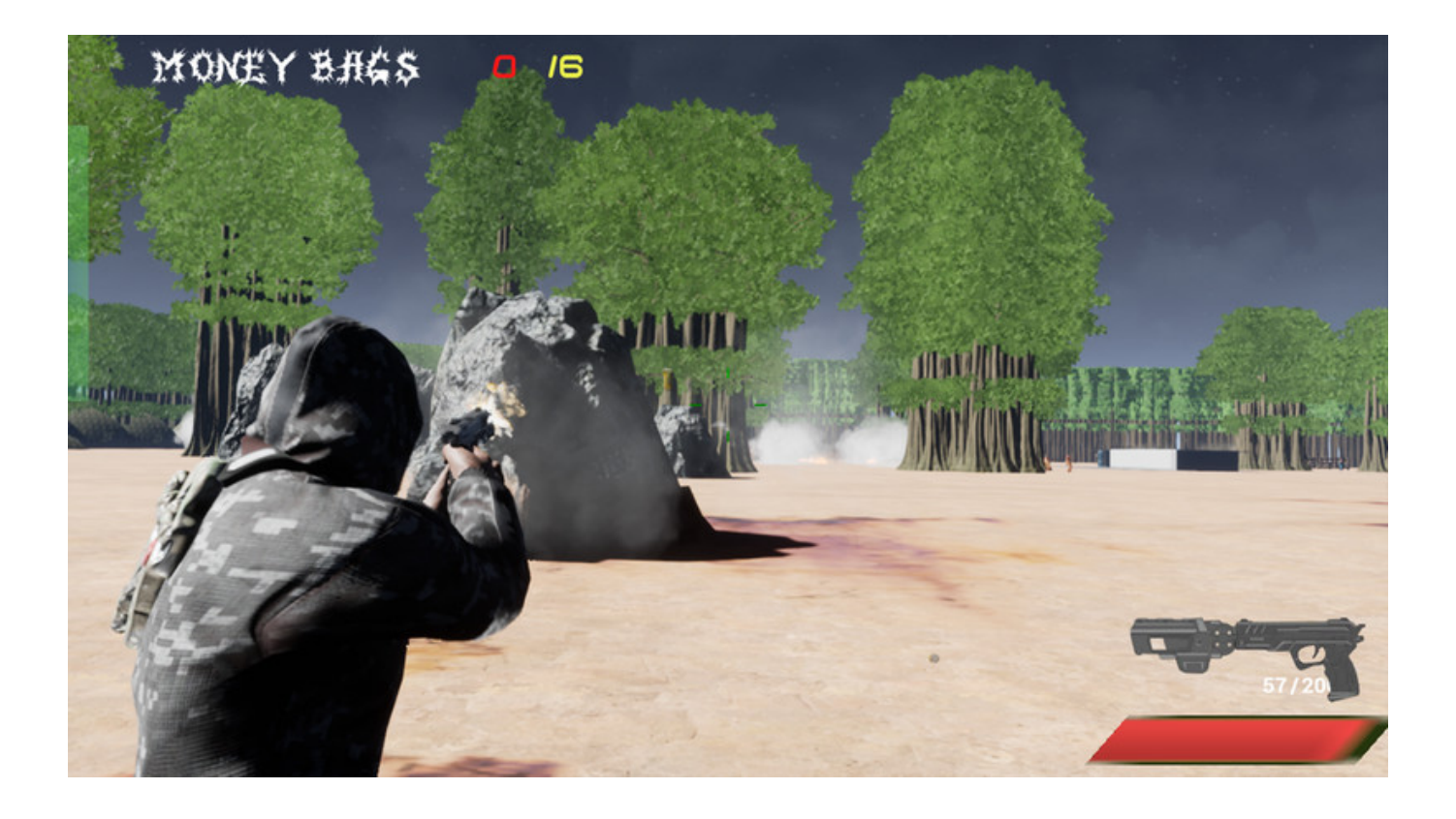
Gangsta Sniper 2: Revenge Torrent Download

Download ->>> <a href="http://bit.lv/2NIkgrY">http://bit.lv/2NIkgrY</a>